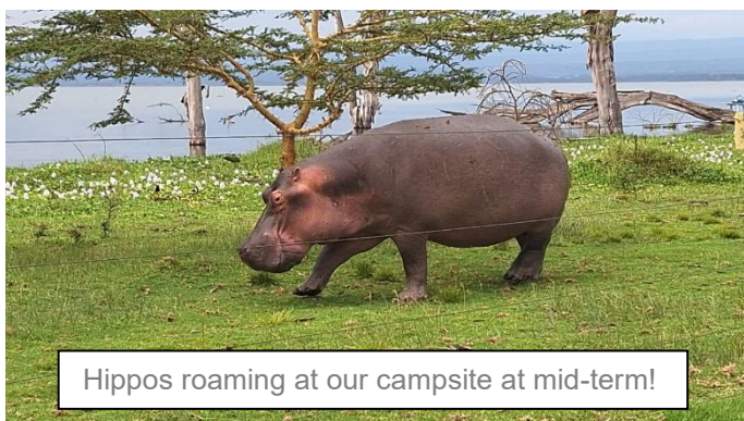
Hippos roaming at our campsite at mid-term!